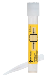
Aptima Urine Kit