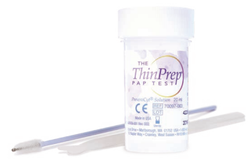
ThinPrep ® Pap Test Vial

*Refer to individual assay package inserts for cleared specimen types and performance claims.