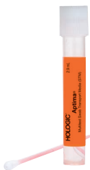
Aptima Multitest Swab Kit

Multiple sample types make the Aptima Combo 2 ® assay for CT/NG easy to order as a stand alone test, along with the Aptima Mycoplasma genitalium assay, the Aptima Trichomonas vaginalis assay or with the ThinPrep ® Pap Test.*